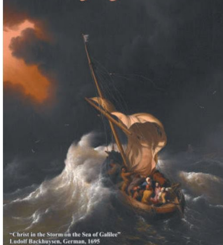
"Christ in the Storm on the Sea of Galilee" Ludolf Backhuysen, German, 1695

O God, Master of this passing world, hear the humble voices of Your children. The Sea of Galilee obeyed Your Son's command when He calmed the stormy waters and delivered the disciples from fear and harm.