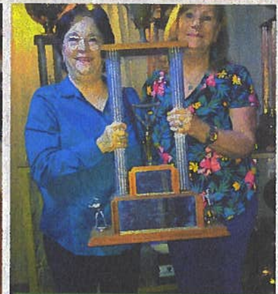
Redemptorist Alumni with Class Trophy