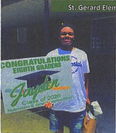
St. Gerard Elementary Students