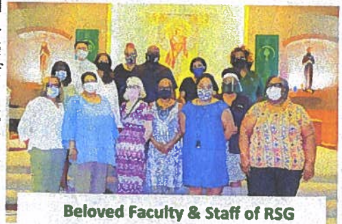
Beloved Faculty & Staff of RSG